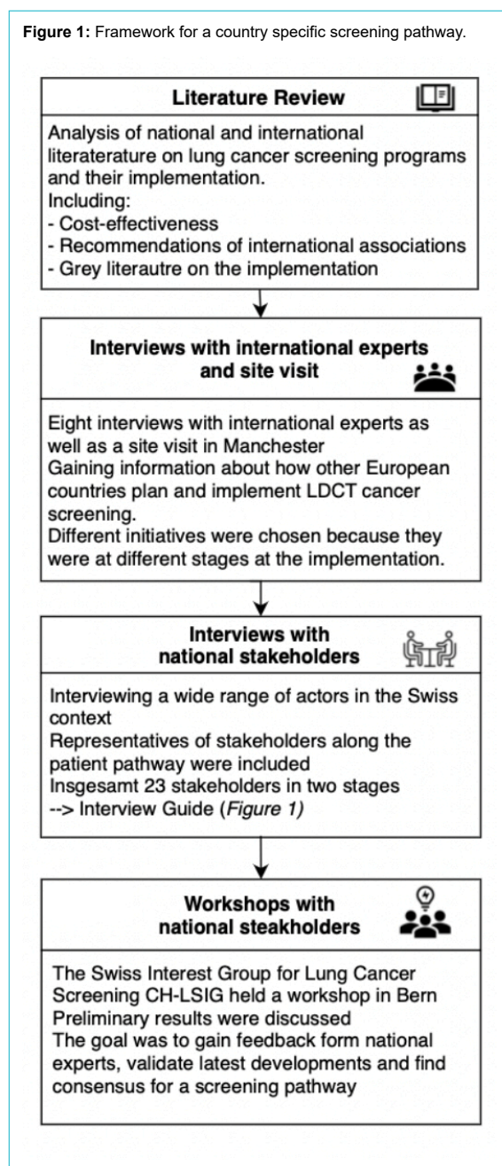
Figure 1: Framework for a country specific screening pathway.